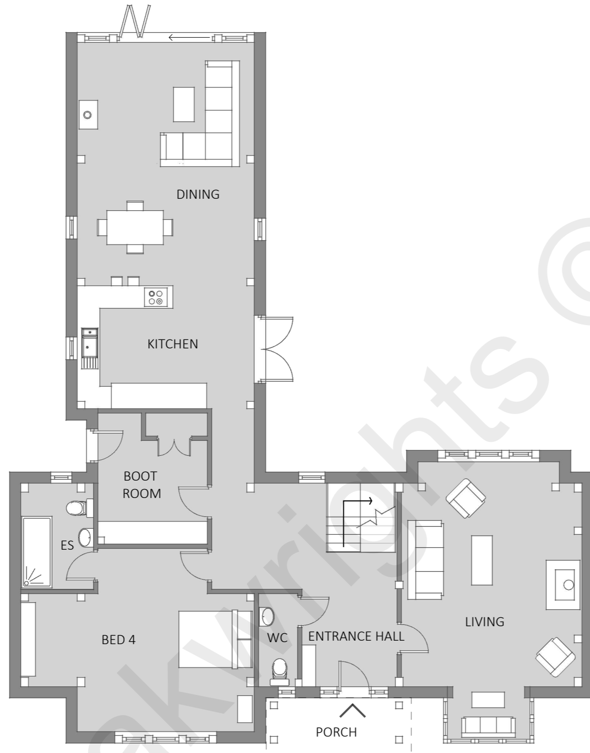
GROUND FLOOR PLAN Proposed NTS