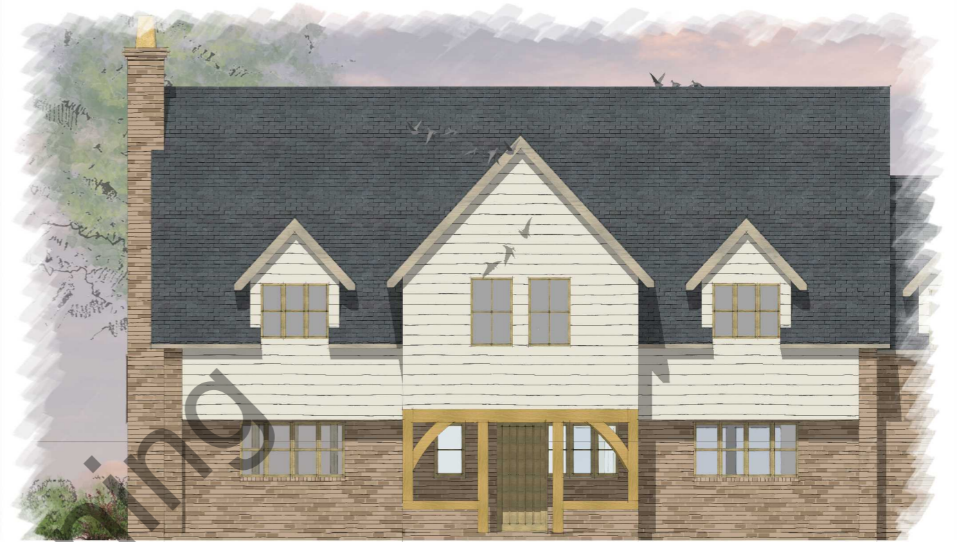
SOUTH ELEVATION Scale 1:100