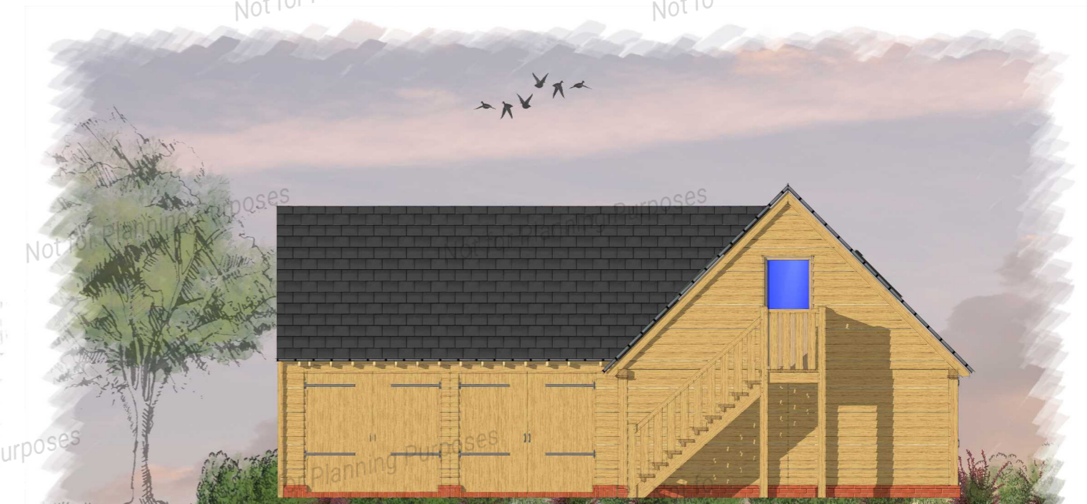
EAST ELEVATION Scale 1:100