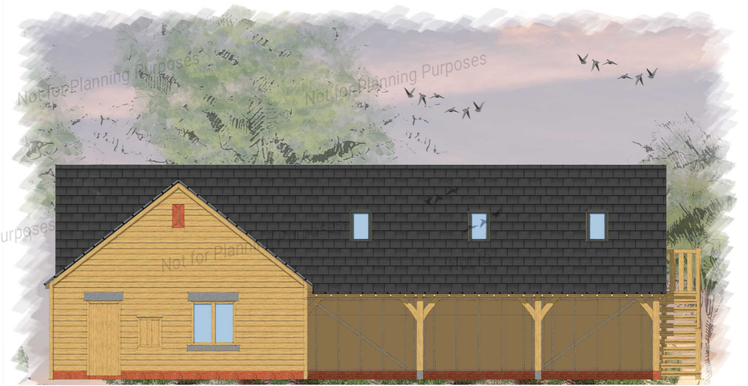
SOUTH ELEVATION Scale 1:100