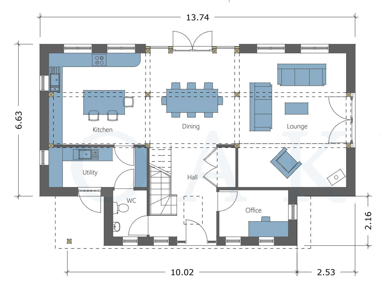
GROUND FLOOR GEA- 93.72m<sup>2</sup>

GEA: 169.64<sup>2</sup>- (1,825 ft<sup>2</sup>) Bedrooms: 3