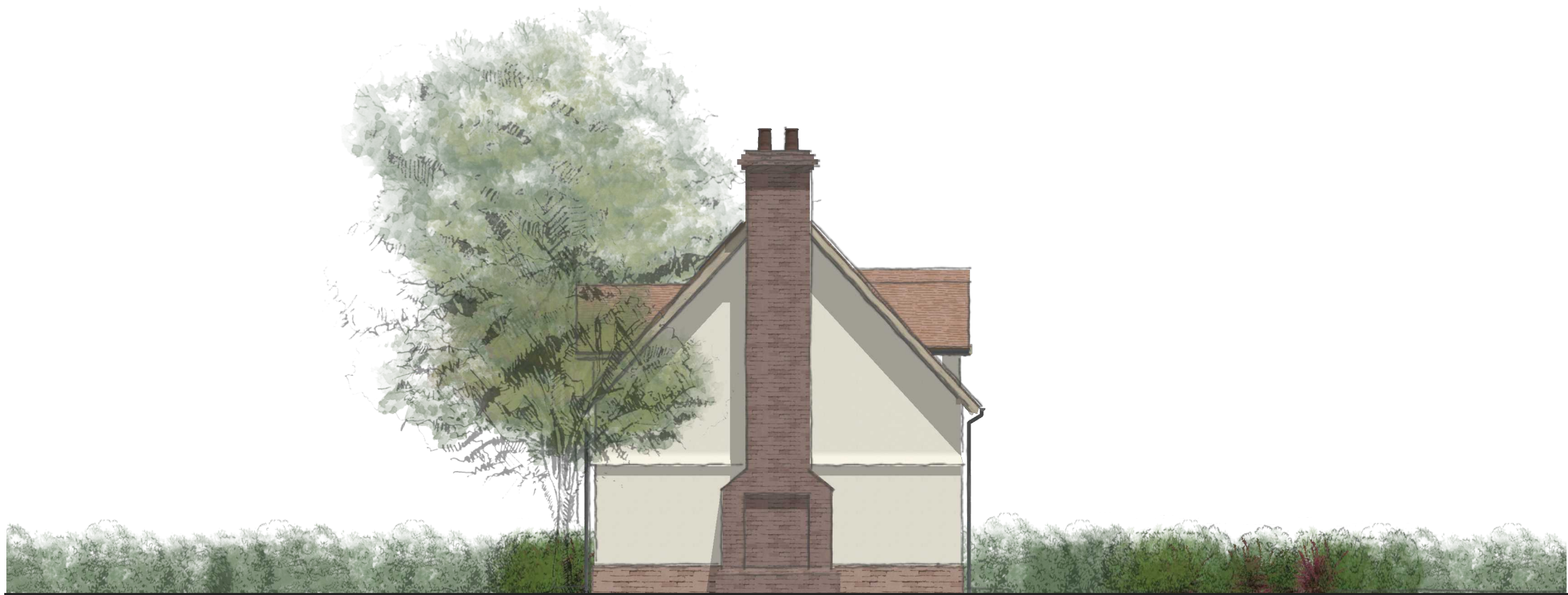
SIDE R ELEVATION