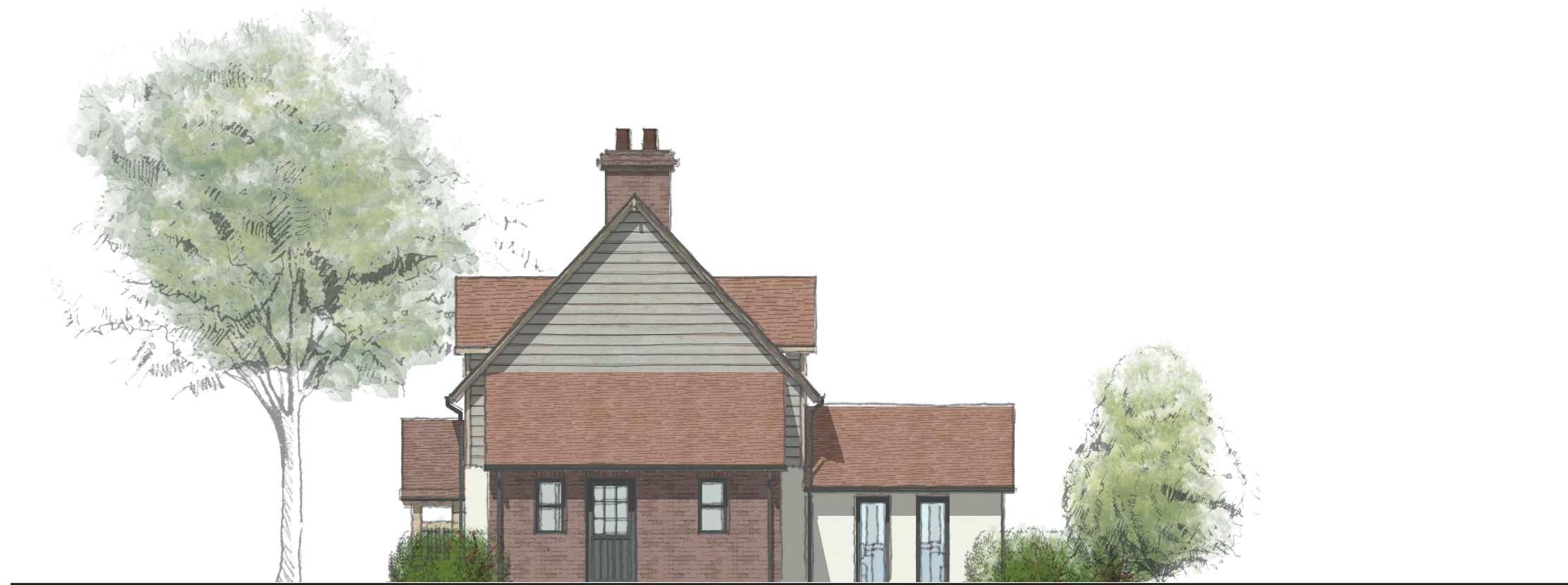
SIDE R ELEVATION