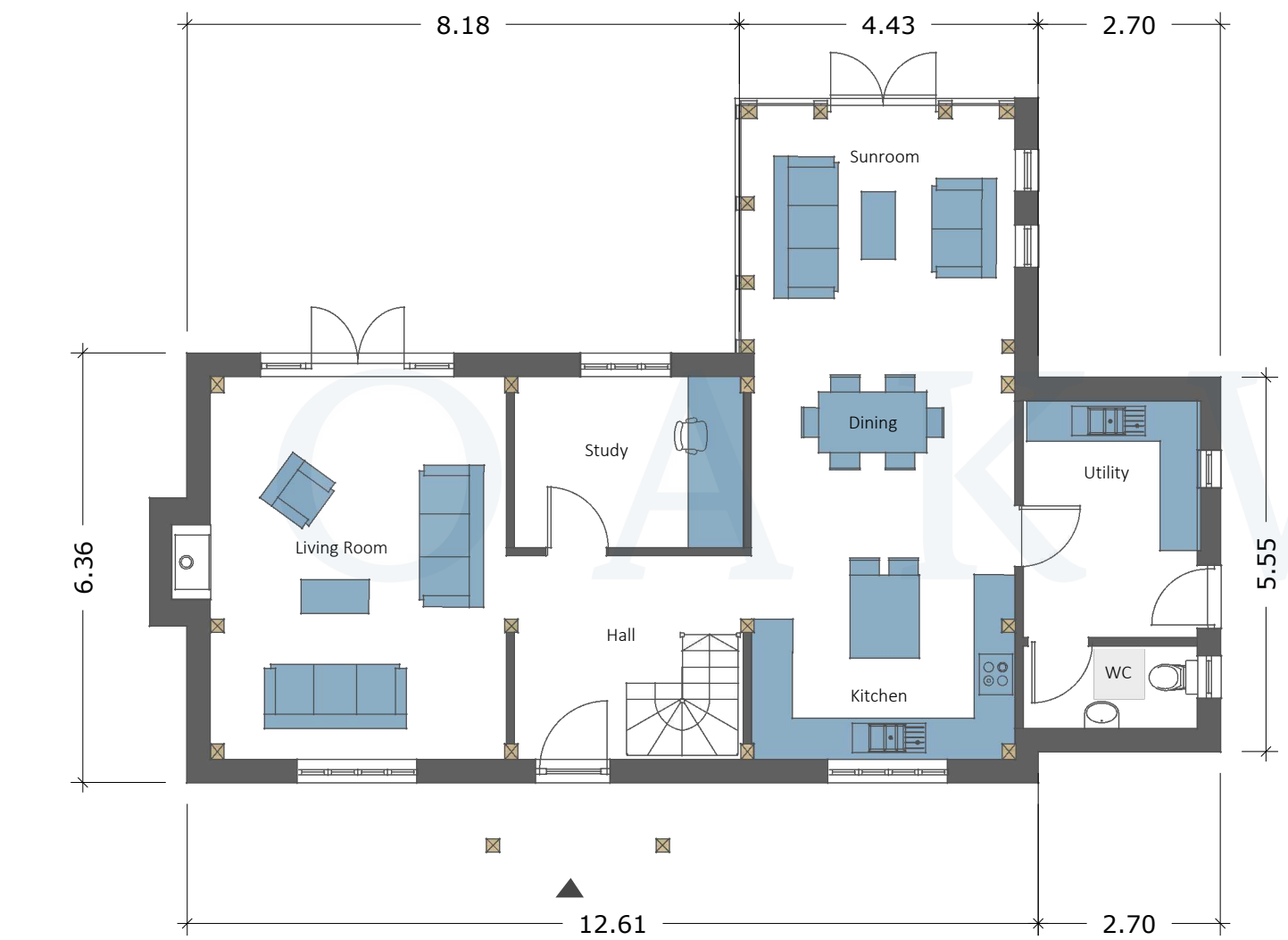
GROUND FLOOR GEA- 116.50 m 2

GEA: 196.70m 2 - (2,117 ft 2 ) Bedrooms : 3