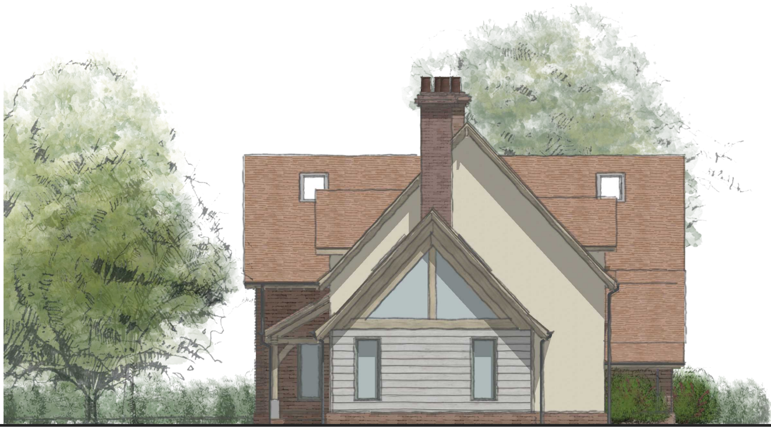
SIDE L ELEVATION