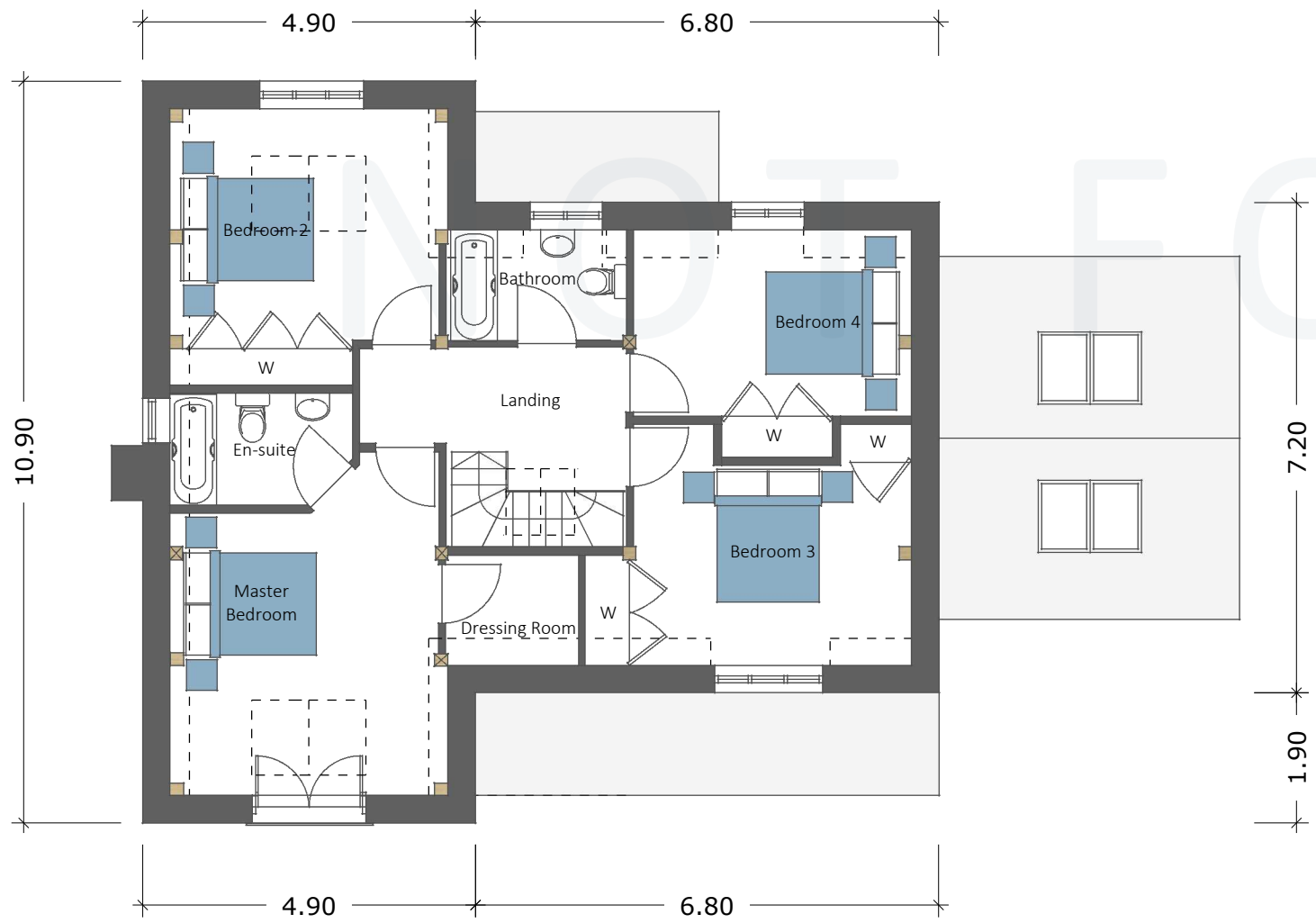
FIRST FLOOR GEA- 102.60m 2