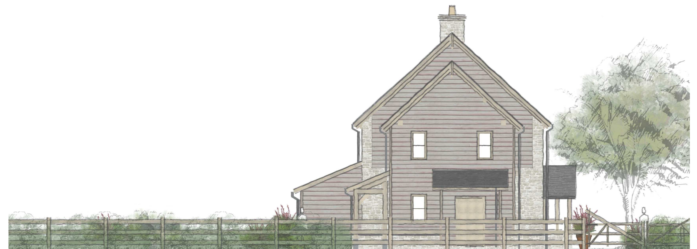
SIDE R ELEVATION