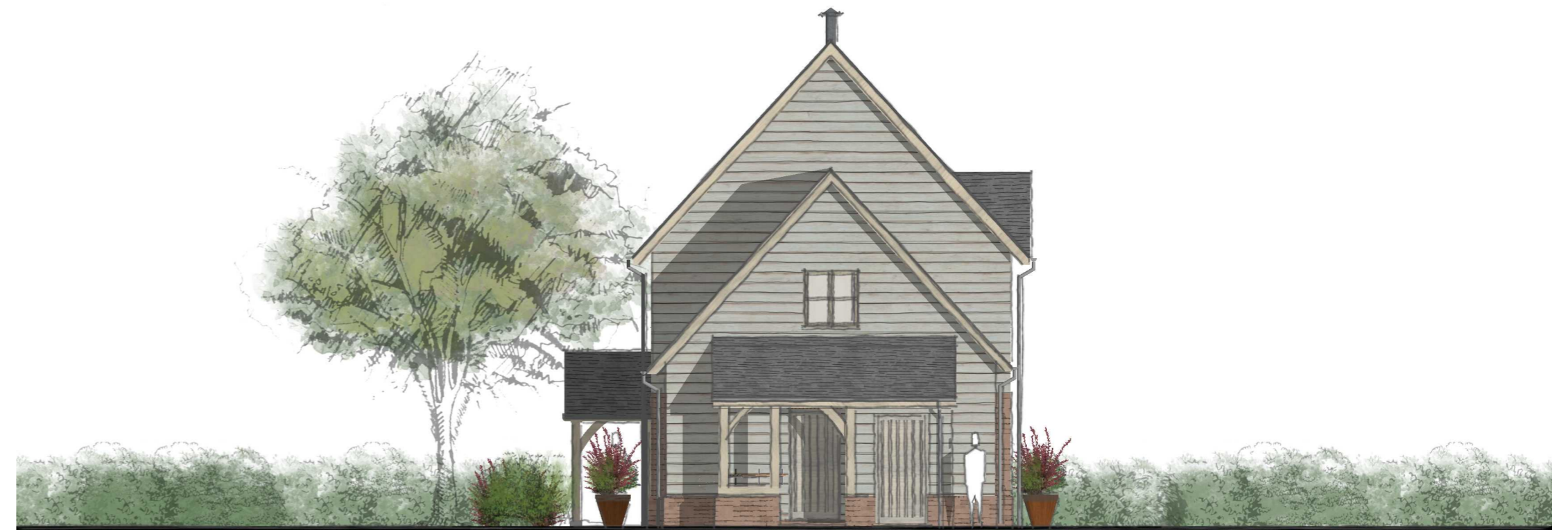
SIDE R ELEVATION