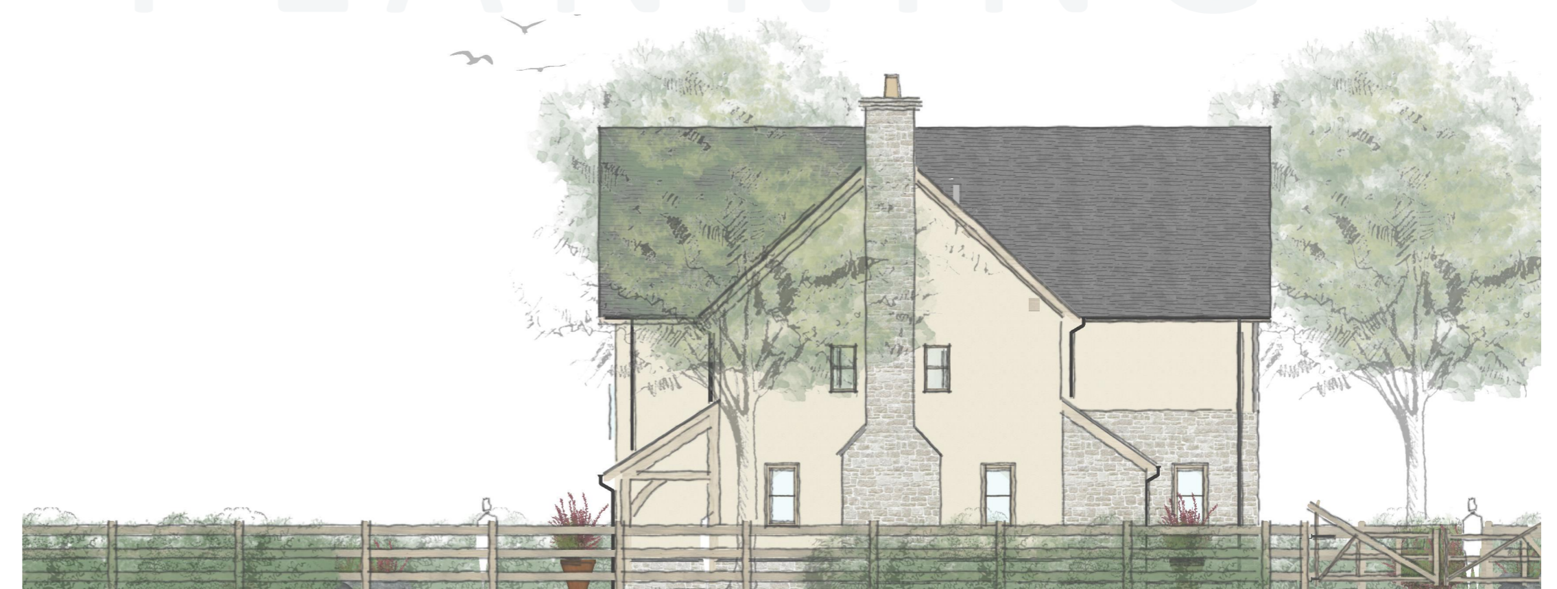
SIDE R ELEVATION