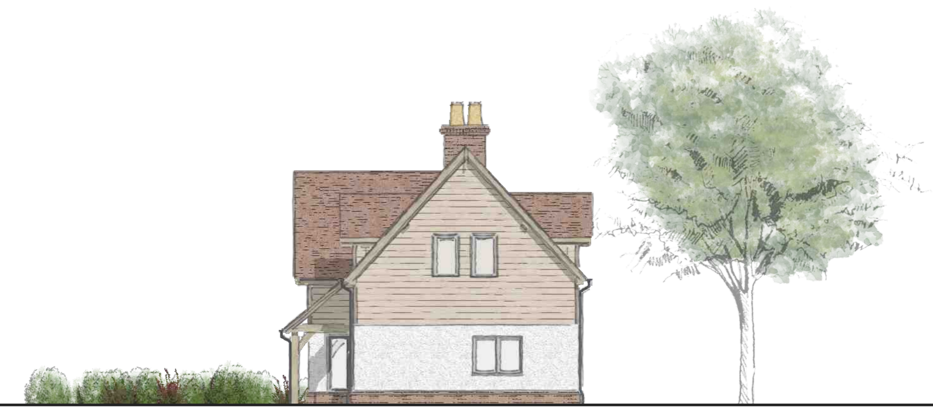
SIDE R ELEVATION