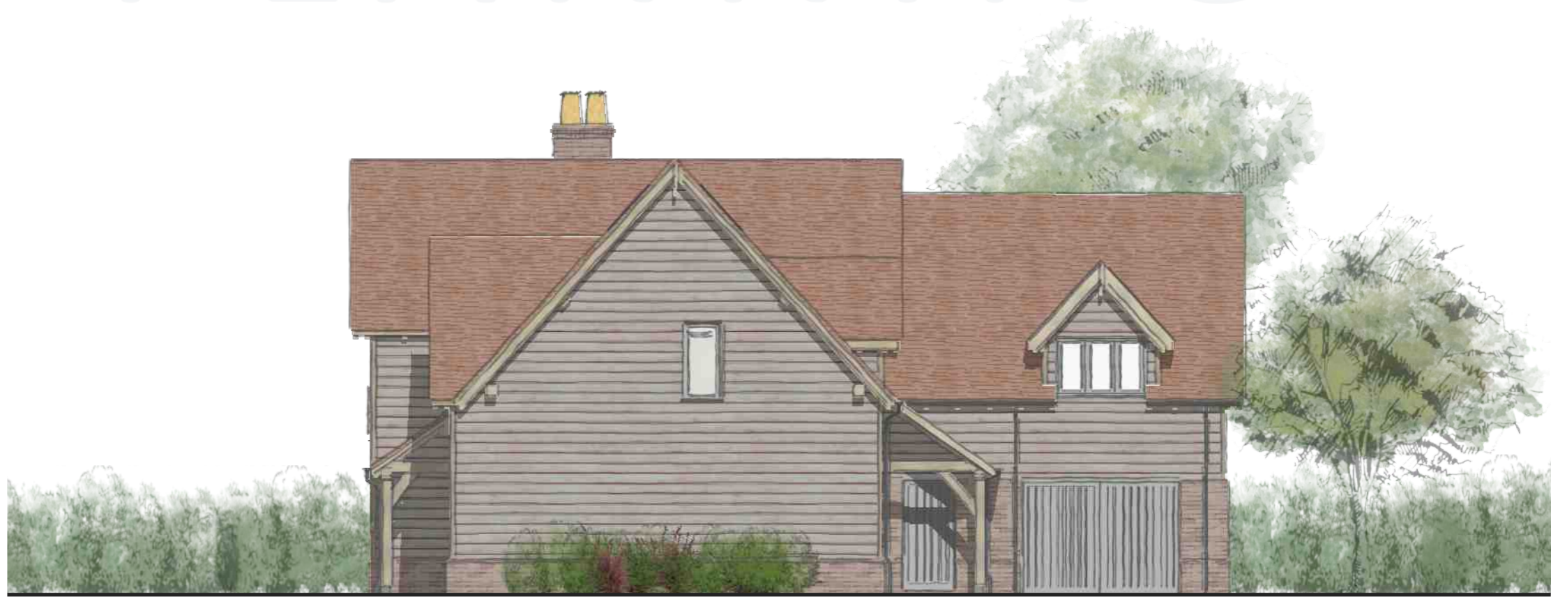
SIDE R ELEVATION