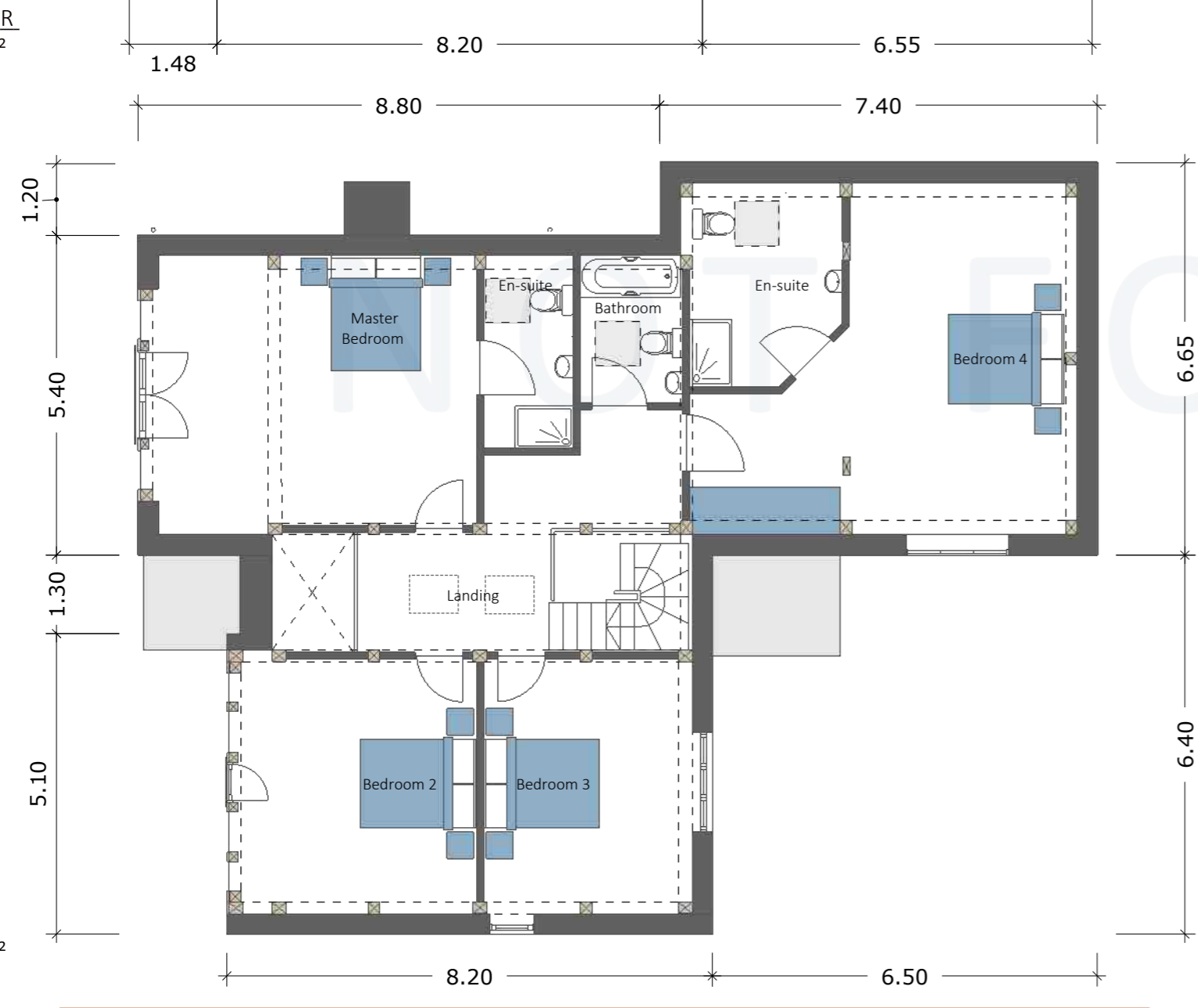
FIRST FLOOR GEA- 148.70 m 2