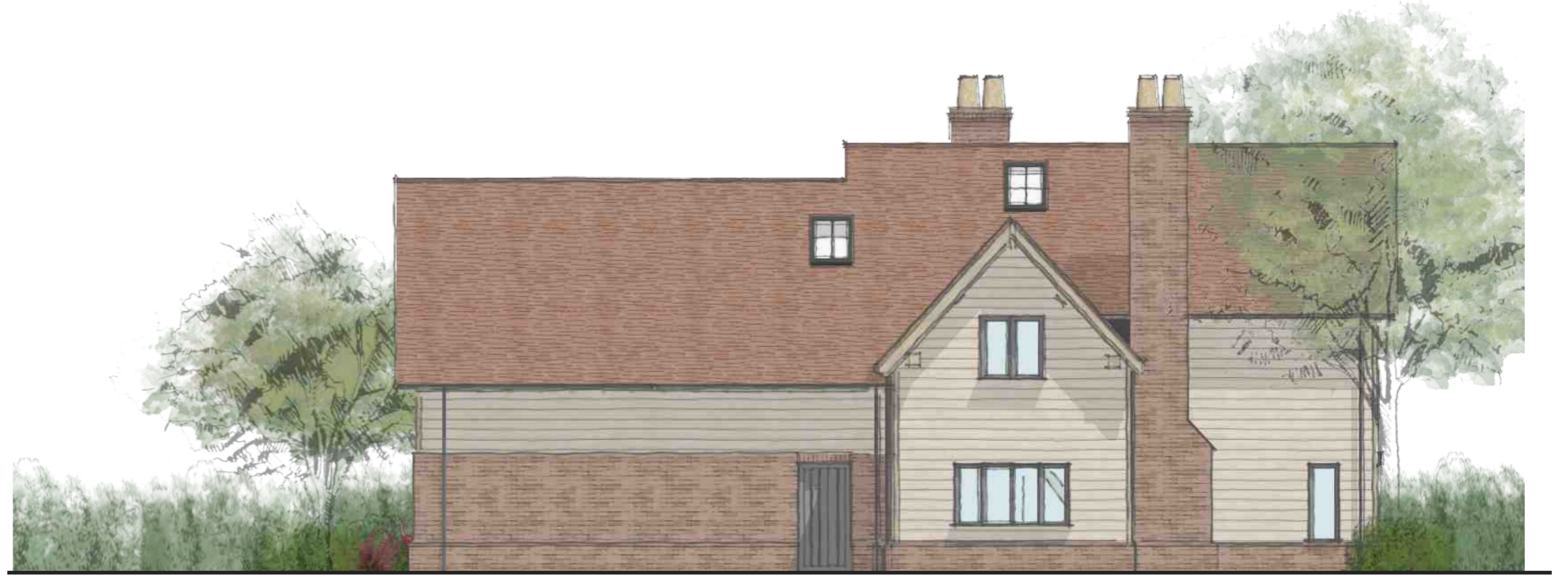
SIDE L ELEVATION