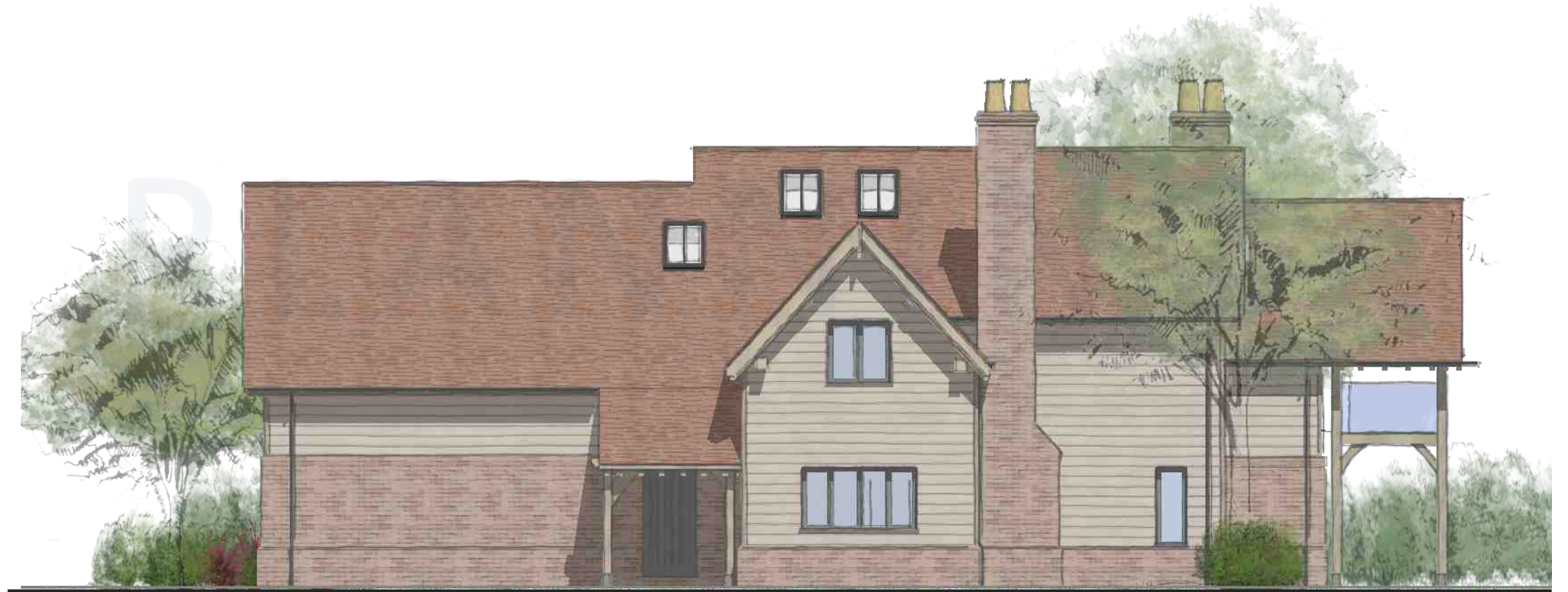
SIDE L ELEVATION