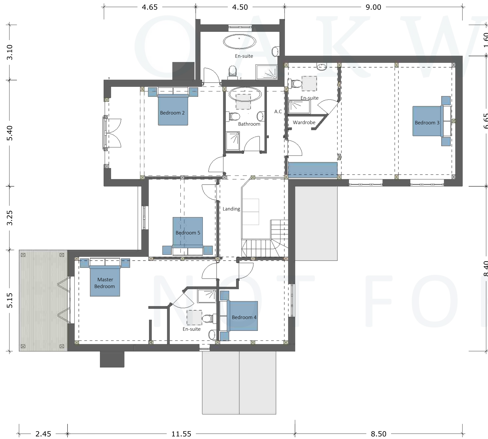
FIRST FLOOR GEA- 220.50m 2

GEA: 450.40m 2 - (4,848 ft 2 ) Bedrooms : 5