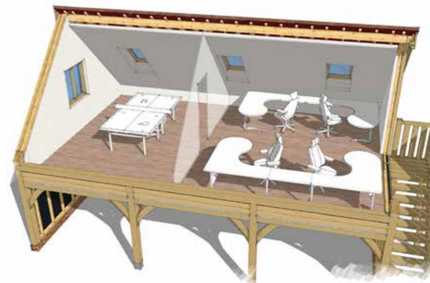
Home office and games room